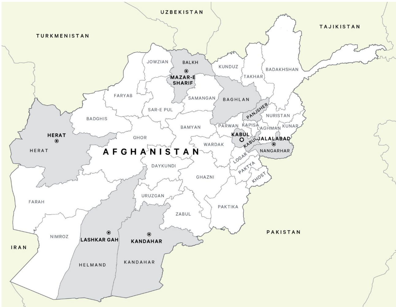
Figure 1. Political map of Afghanistan

anticipated the need to provide assistance to 15.7 million Afghans in 2021. Of the $1.3 billion of funding that was required, just 12 per cent had been received at that date (although this subsequently improved to 35 per cent, as more donations were received over the summer).